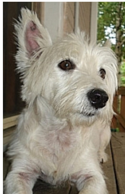
and this was Sugar on August 19th

Lotions and Potions: We have found a product that we have used on our itchy Westies that has been great for us. It is in a shampoo, cream and spray form and it has worked wonderfully well