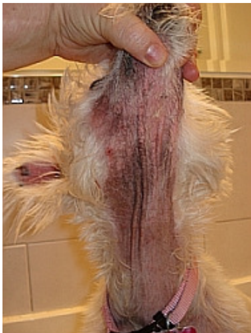
This was Sugar on July 5th

Remember, the key is to get the feet submerged in the solution, which will wash away any type of yeast that might be growing, as well as mild bacterial infections, allergens, and other contaminants. Dry them off and they are good to go!