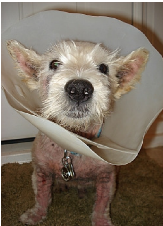
this was Sammy on Aug 19 th

Use a Calendar: We strongly suggest that you keep a calendar handy that just has your Westies' health info on it. When you record daily changes, changes to foods, snacks or treats, changes with tummy upsets, scale of itchiness, etc... very often you will begin to see patterns that will help you when treating your dog.