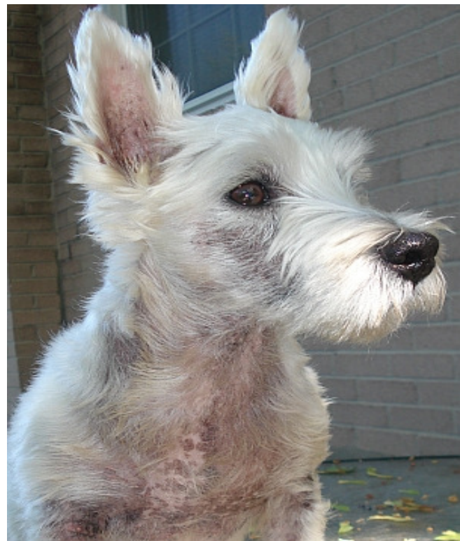
and this was Sammy on September 27 th

Shampoo: many of our Westie owners have had amazing results with a relatively new system called NAGAYU CO2 skin treatment . It is helping Westies everywhere with issues like